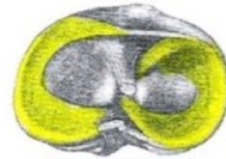
Figure 2C Modern Knee Joint

The asymmetrically twisted and malformed menisci highlight the abnormality of the modern knee, the medial meniscus is pushed far forward, the lateral backward ( FIGURE 2C ), unlike those of a barefoot knee.